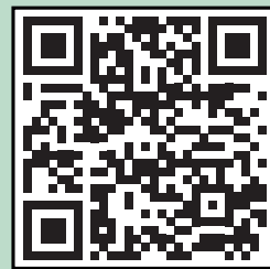
More info on Golf Classic

For more information about our golf classic, please contact us by phone, email, text or online. We would love to talk with you and share our love of this event or visit our website at: www.concordiaclassic.golf or scan one of the following QR code: